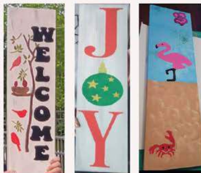
Two Foot Wood Sign