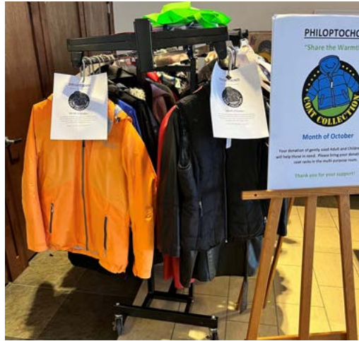
▲ Collection rack at church