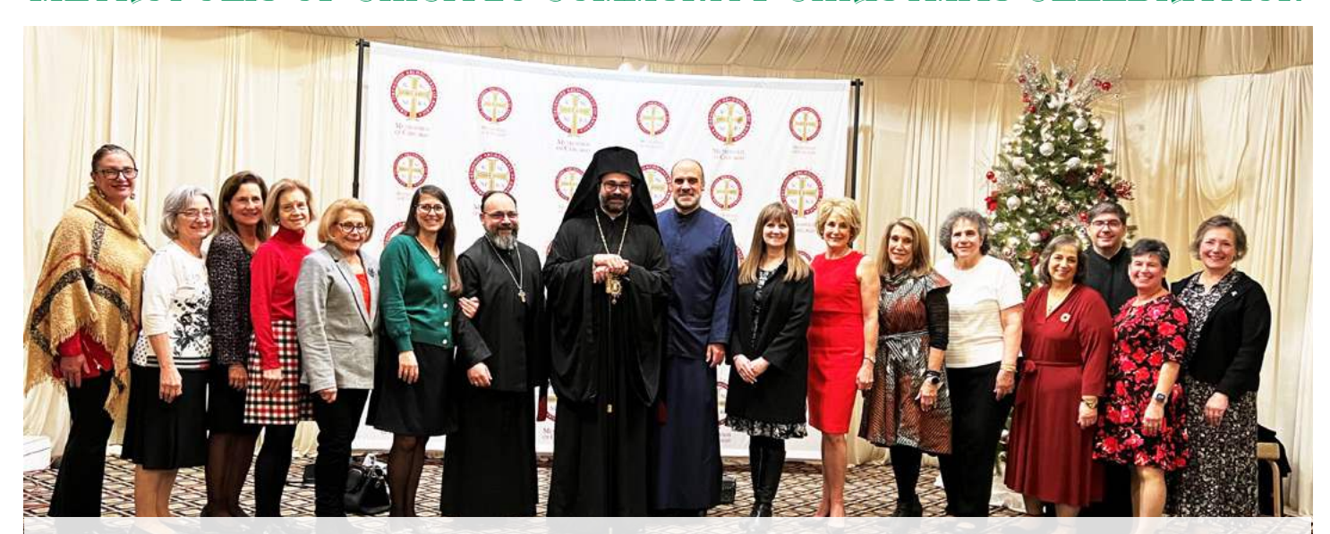
Celebrating the Holiday Season! Clergy, Presvyteres and parishioners of Holy Apostles attended the Metropolis of Chicago Community Christmas Celebration at The Carlisle in Lombard on Sunday, December 3.