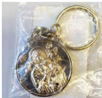
FOR STOCKING STUFFER: Theotokos Key Chain: $2.25