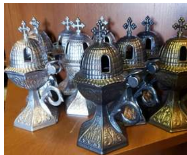
FOR SOMEONE SPECIAL: Incense burner: $10; Incense: $3