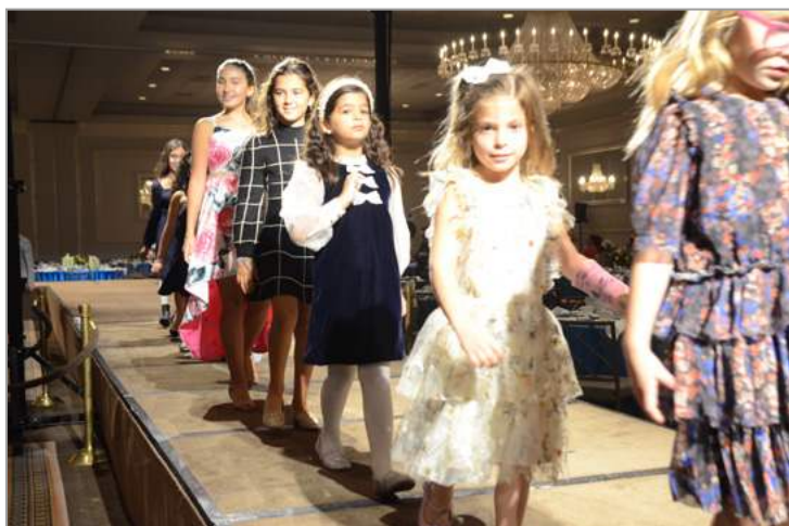
▲ Our wonderful Holy Apostles children models. ►