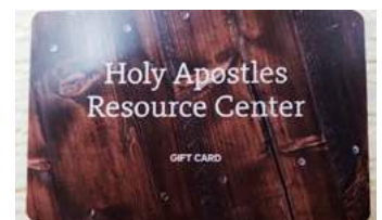
FOR THOSE HARD TO BUY FOR: Gift Card!