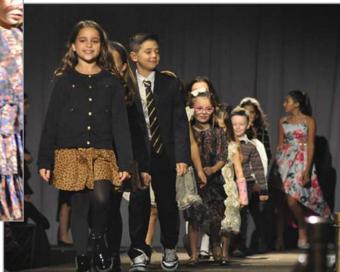
◀ Greek Goddesses welcome all to a Mediterranean Adventure