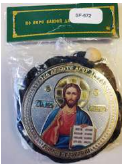
FOR THE TREE: Ornament: $10