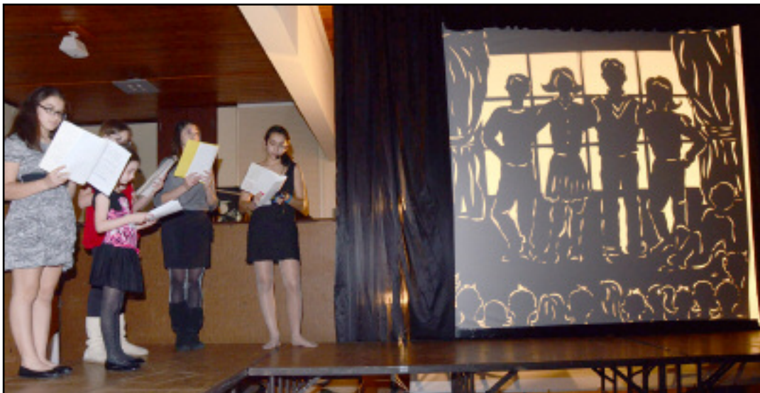
Radio actors with the Shadowbox present Adventure Theater's production of The Cousins' Christmas Surprise at left.