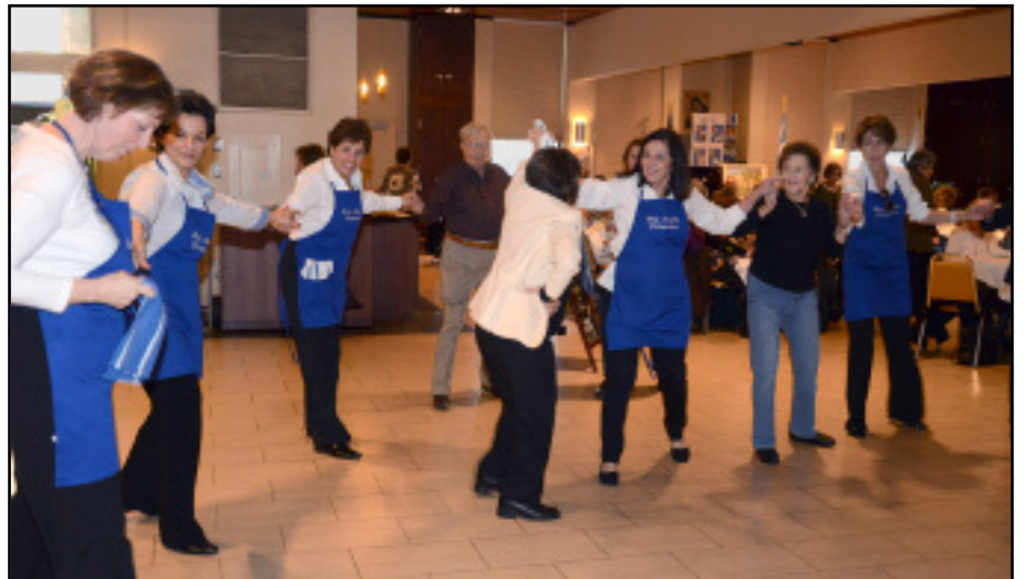
Philoptochos members enjoy dancing for the crowd.