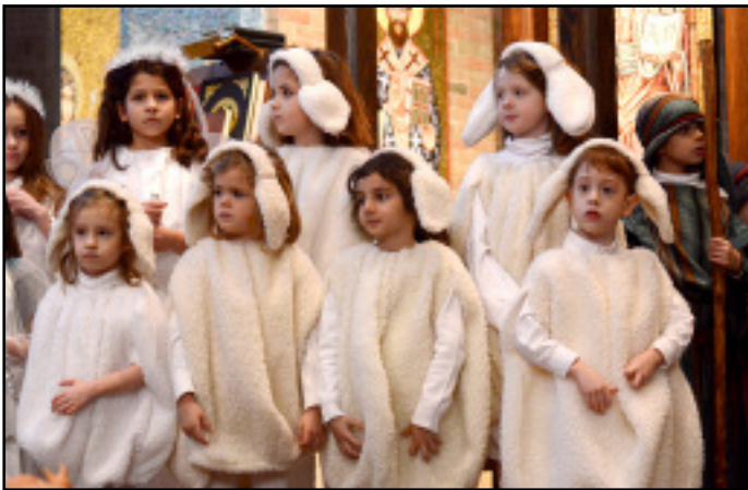
The lambs make their appearance at this year's pageant.